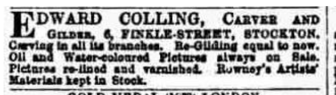
Figure 1 Northern Echo - Monday 07 April 1879