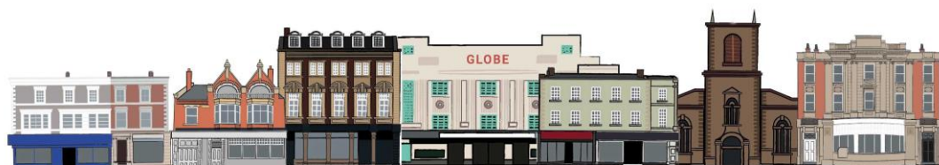
Figure 4 Hartlepool Northern Daily Mail - Monday 14 October 1907

G. J Clarkson Patent Office is advertised as operating from the address in 1906 and 1907.