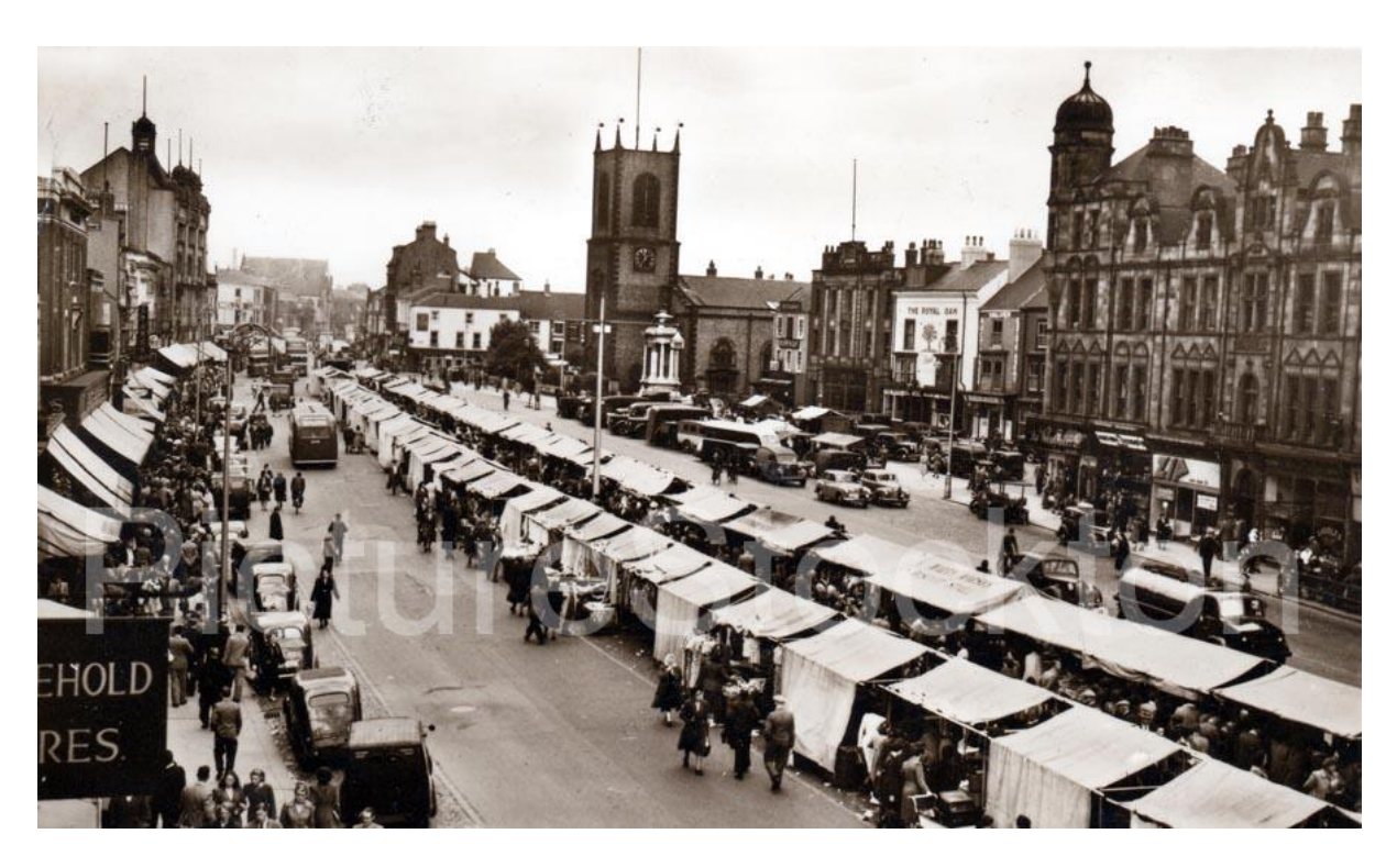
Figure 5 Stockton Market c1940s/1950s