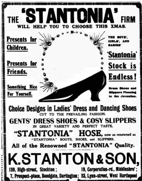
North Eastern Daily Gazette 21 st December 1911