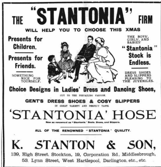
Whitby Gazette 15 th December 1911

The 1911 Census Summary describes 139 High Street as a lock up shop with Stanton as the occupant. 139a is described in the summary also as a lock up shop. It is occupied by Nelson & Son.