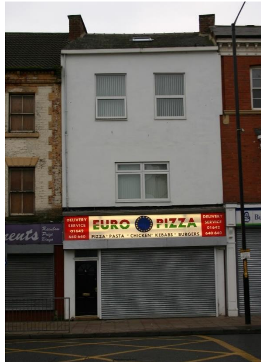
Figure 4 6 High Street Courtesy of Peter Moon (5 February 2006)

Below there is an image of the property taken in 2006 when it was occupied by a company called Euro Pizza.