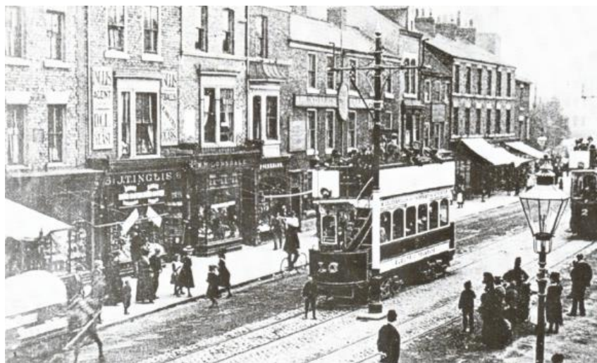
Figure 3 High Street Stockton, Showing Inglis Tobacconist 6 High Street 1898