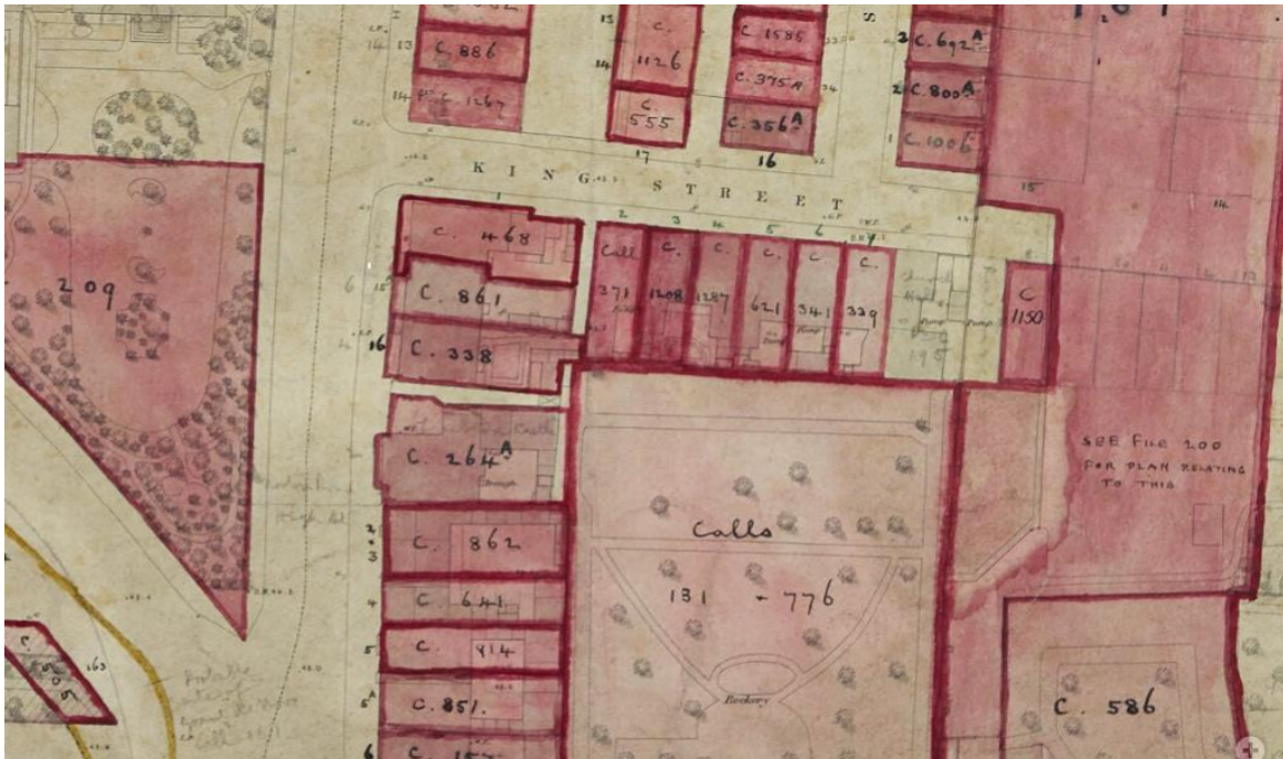
Figure 1 1855 Map of Stockton- Mirador Viewer (durham.ac.uk)

This map from 1855 shows 5a High Street as a separate entity.