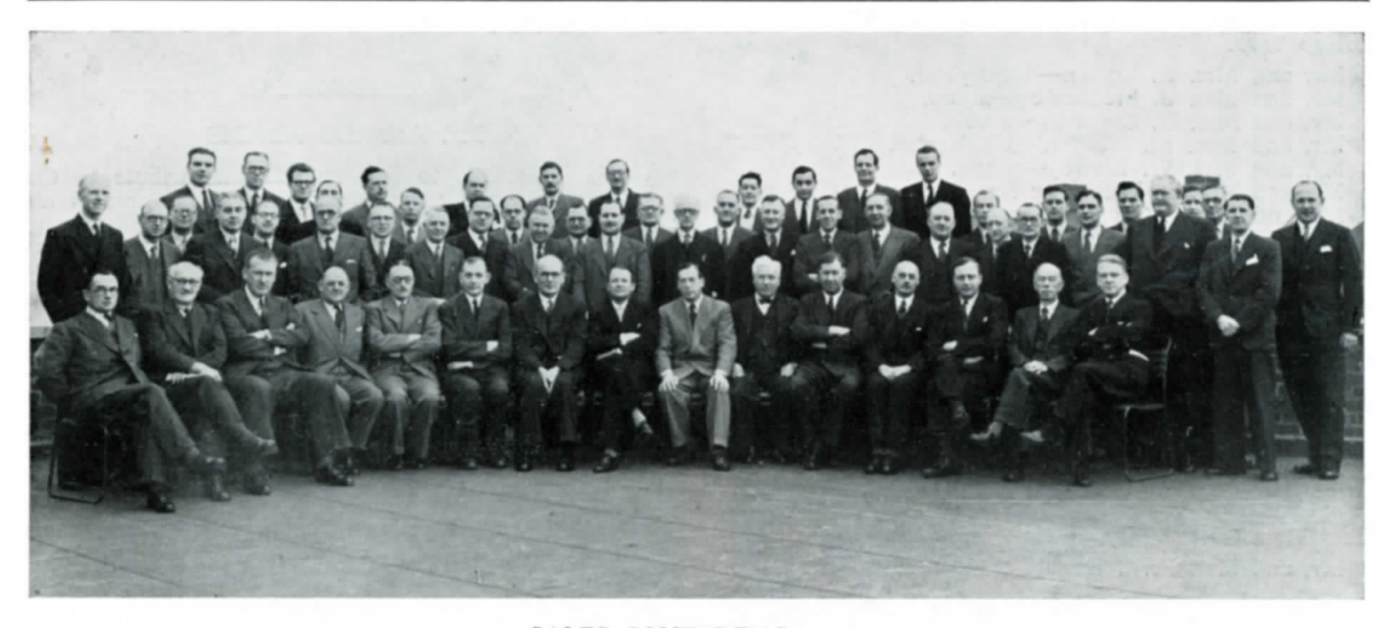
SALES CONFERENCE 1954