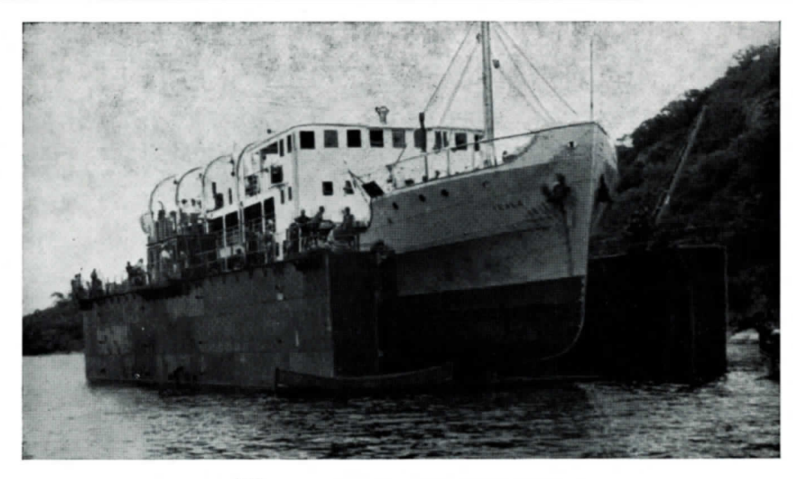
500 TON FLOATING DOCK—LAKE NYASA