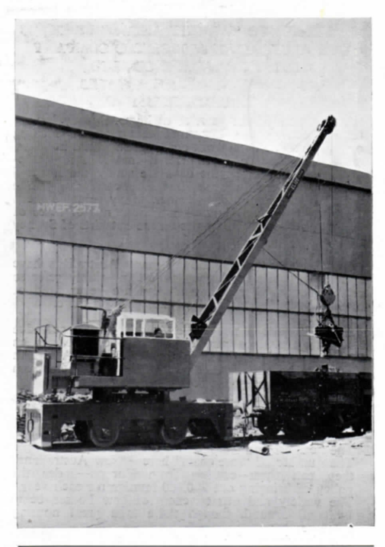
Published by Fead Wrightson & Co. Ltd., and printed by Charles Ingle (Printers) Ltd., Thornaby-on-Tees England.

officially, we are still using the same locos, one can well imagine that the amount of spare parts and replacements which have been fitted, has just about rebuilt these engines four or five times over. Though they still manage to perform their worthwhile function, it has been found necessary to improve the locomotive service and new diesel locos have been obtained for Teesdale, Forge and Egglescliffe and our picture shows the new Jones K.L.100 Diesel Driven Shunting Crane at Egglescliffe. This latter is, of course, dual purpose and it does a tremendous amount of loading as well as pulling the trucks.