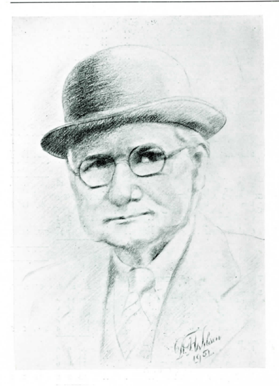
H. W. PERSONALITIES - No. 10