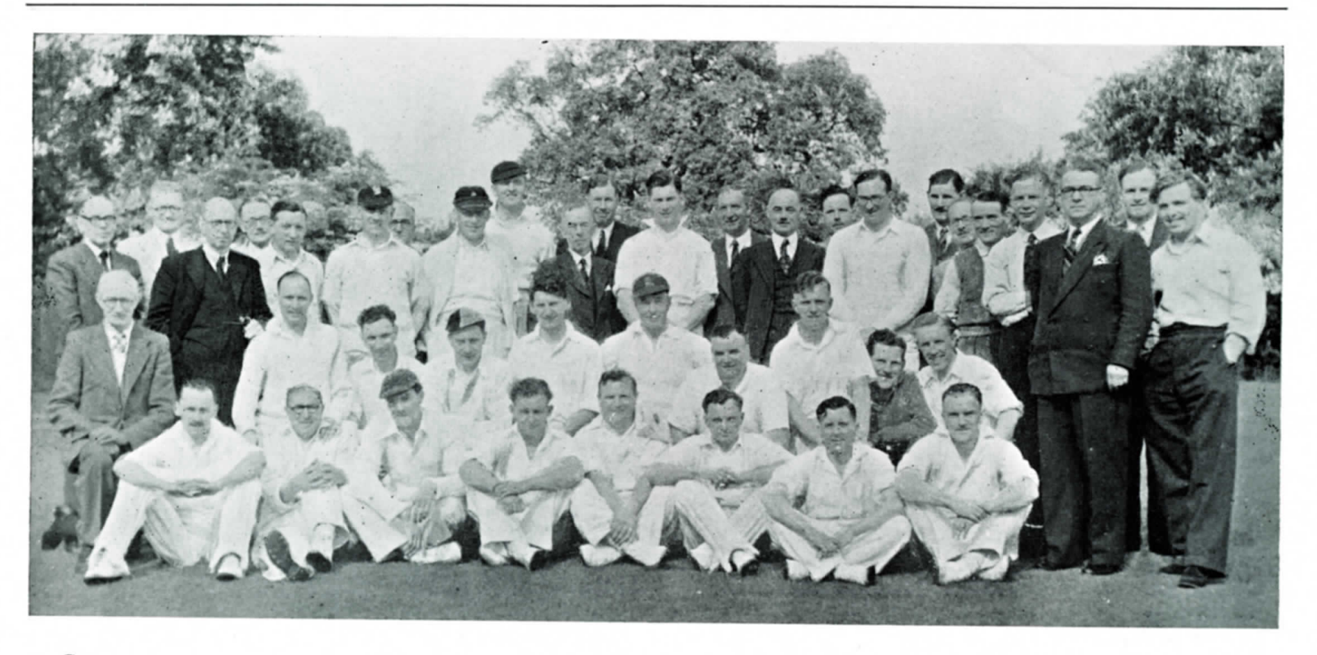
CONTESTANTS AND SUPPORTERS AT THE CRICKET MATCH WITH HEAD WRIGHTSON PROCESSES AT DULWICH COLLEGE GROUND, LONDON.