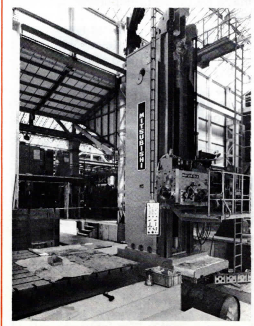
B & S Massey's new ram borer machine being installed in their heavy machining bay.

Progress photograph taken in July of the new Wrightstock warehouse at Worsley under construction. (Photo by courtesy of A Lancaster Britch & Associates, Chartered Architects).