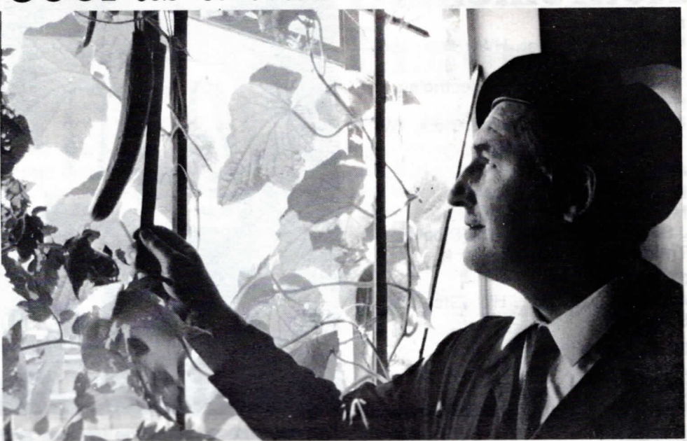
One of the cucumbers measured 13

Calling all market gardeners! Did you know that the finest cucumbers can be grown inside a foundry?