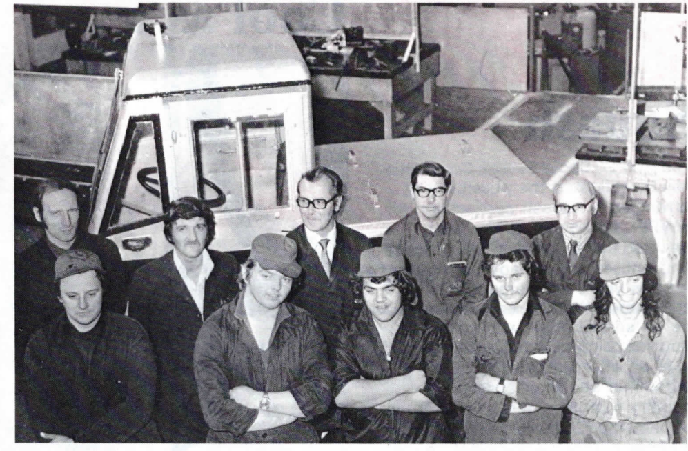
The eel, with some of the trainees and their instructors.

For many years the Billingham Foundry of Steelcast has run and worked an electric truck which served as a push/pull moving hot metal ladles up to 50 tons within the foundry.