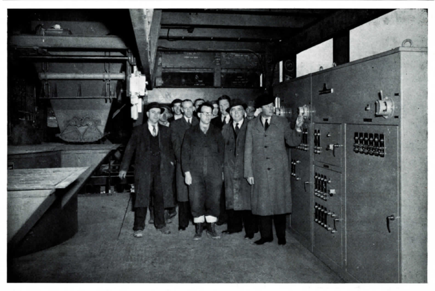
The Chairman, pictured at the Control Panel of the new £100,000 Sand Plant at Egglescliffe Foundry, after having performed the opening ceremony on 2nd May, 1961