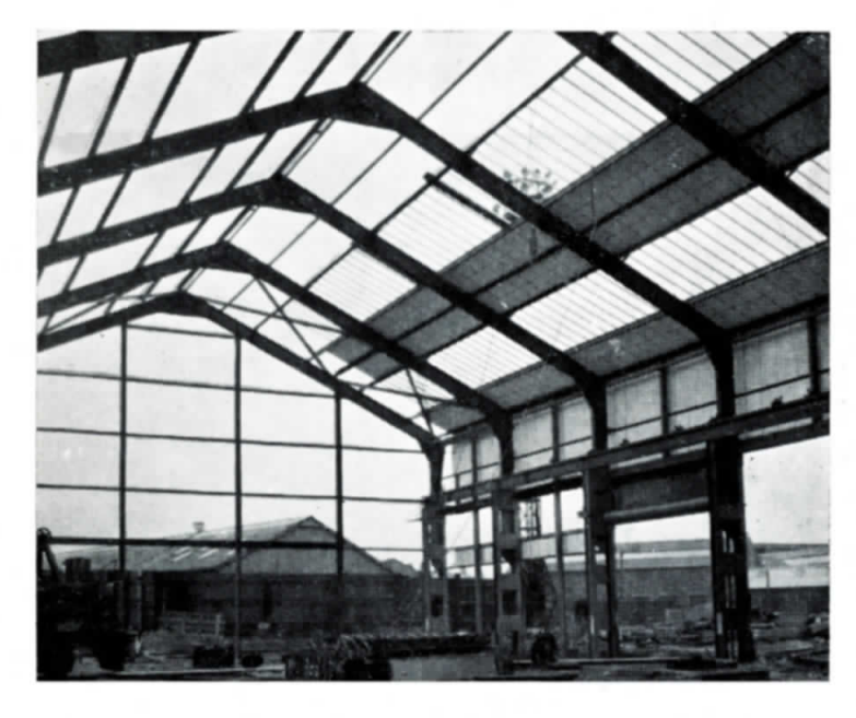
Extension to Welding Shop