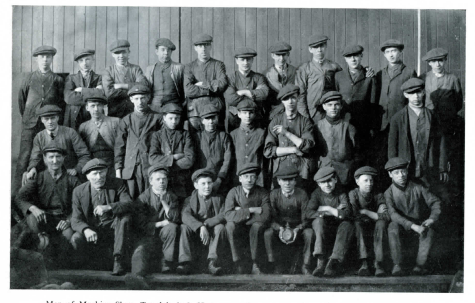
Men of Machine Shop, Teesdale in ? How many do you remember and can you state the year ?

This photograph was provided by an older member of the firm. Some of the men are still with us. There is no prize but the Editor thinks you might enjoy trying to recognise present and past employees.