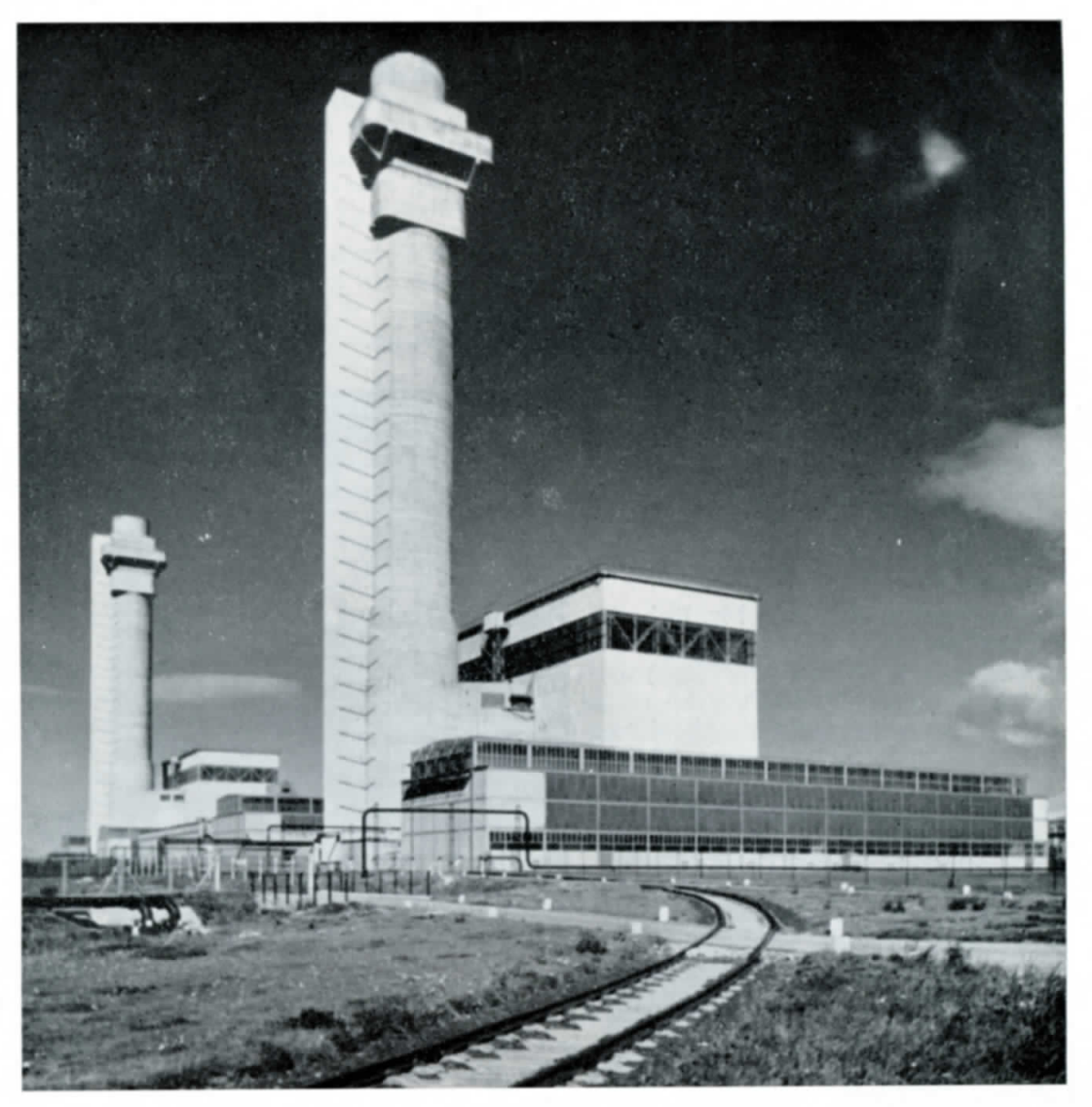
The Windscale plutonium producing factory at Sellafield, Cumberland

Sir John and I have visited most of the U.K. Atomic Energy works lately, where they make Uranium from the ore; where they enrich ordinary Uranium 238 with the better fissile material Uranium 235; where they make