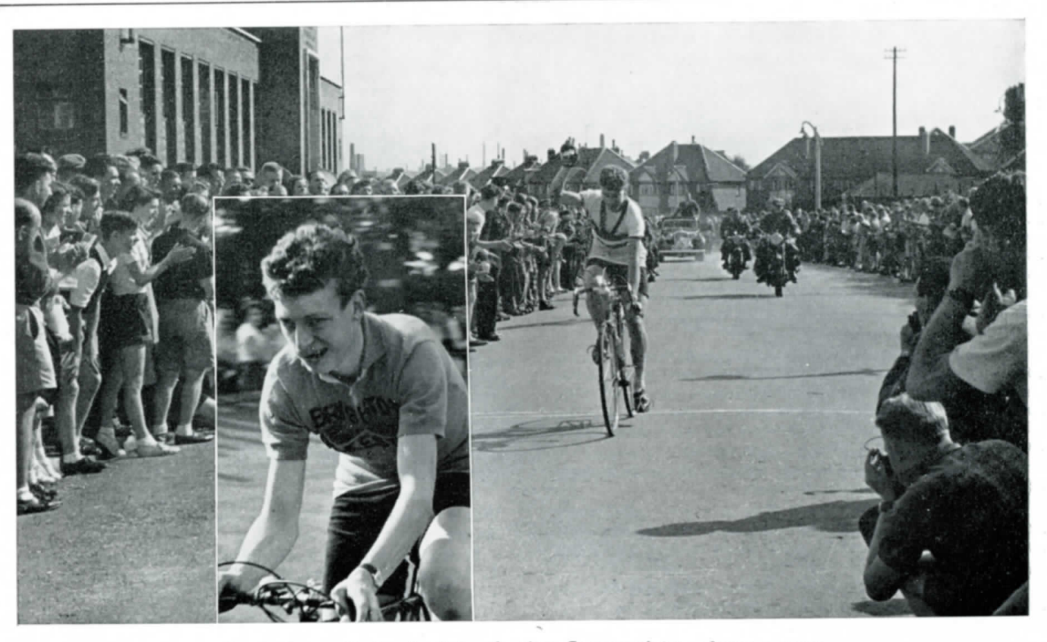
Inset shows Graham's determination. Larger picture shows success.