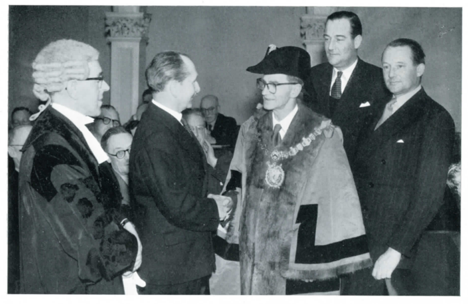
Presentation of Mayoral Robes