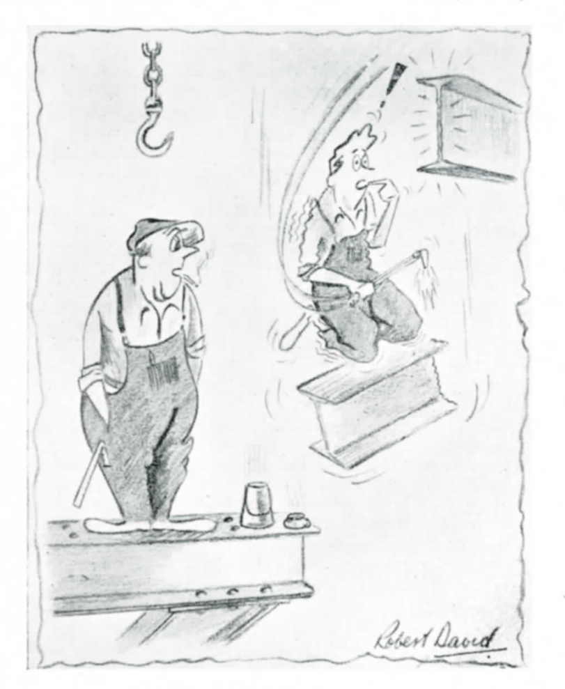
"Want any advice, Jimmy?"