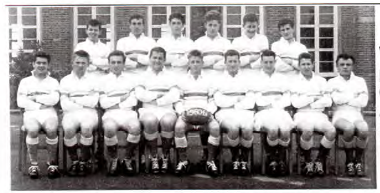
Who is in this photograph? Get in touch and let us know!

Our Sri Lankan driver was following the entire encounter with a look of incredulity!