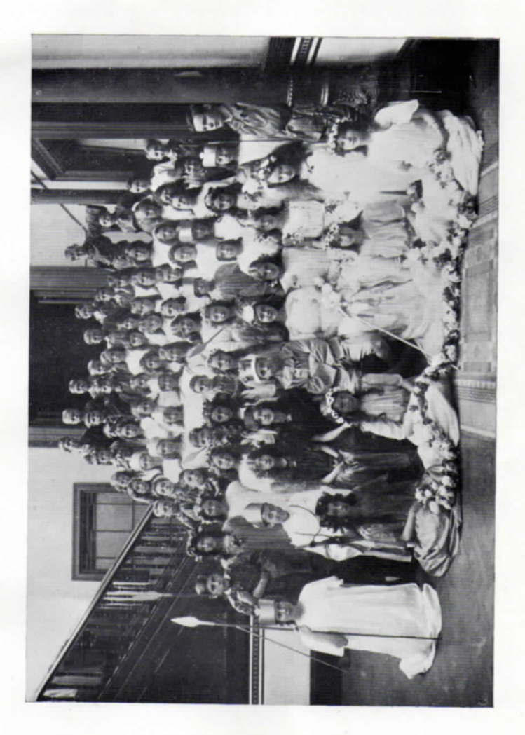
OPERETTA GROUP. MIDSUMMER, 1913. "QUEEN MAB."