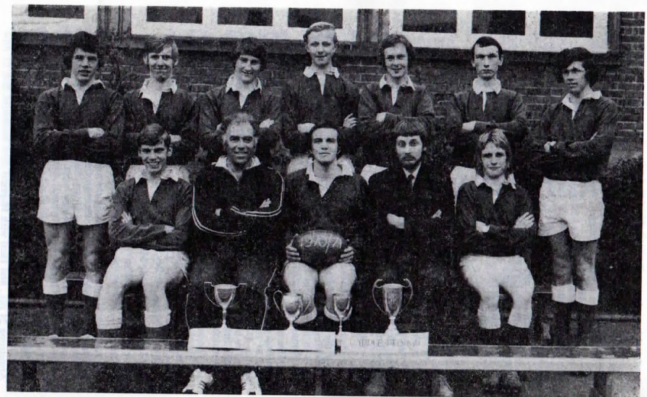
The sevens squad with their four cups.