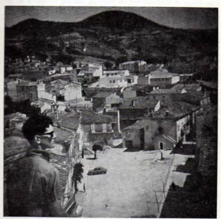
The Nursery, viewed from the highest point in the village, is in the centre of the middle distance.

P.S.—This book cannot be sold in U.S.S.R., Formosa and Belgium (and perhaps many other places) due to the copywright situation.