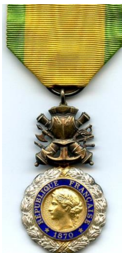
The Médaille Militaire