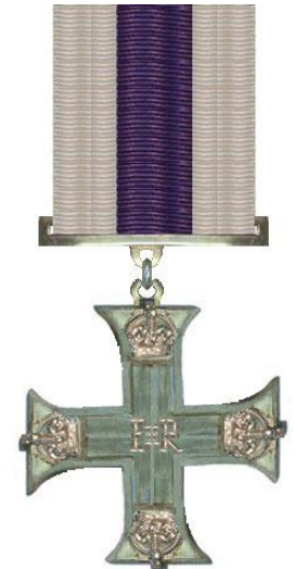
The Military Cross