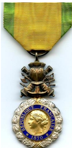
The Médaille Militaire