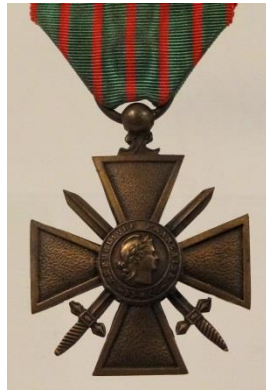
The Croix de Guerre

shock or excitement causing palpitation. Medical evidence showed that she had died from heart failure. S&T.H. 9 June 1917