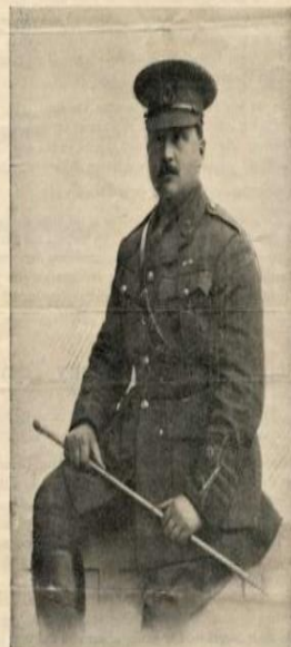
GILBERT O. SPENCE, COLONEL. Commanding the 5th Durham Light Infantry.

YOUR KING WANTS YOU ! YOUR COUNTRY WANTS YOU ! YOUR CHUMS WANT YOU !