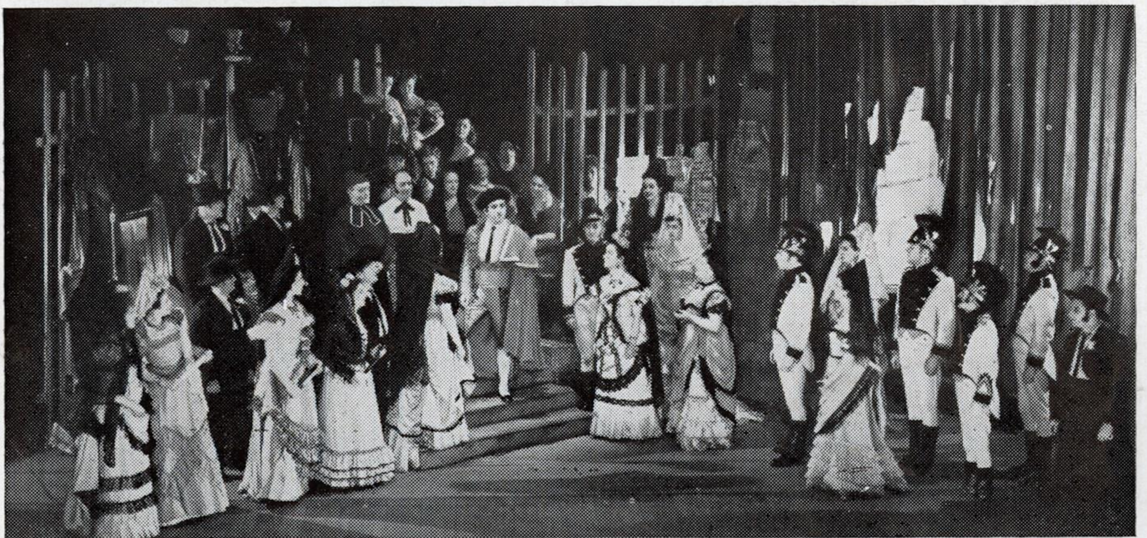
CARMEN—Act IV : Escamillo's dressing room behind the bull ring