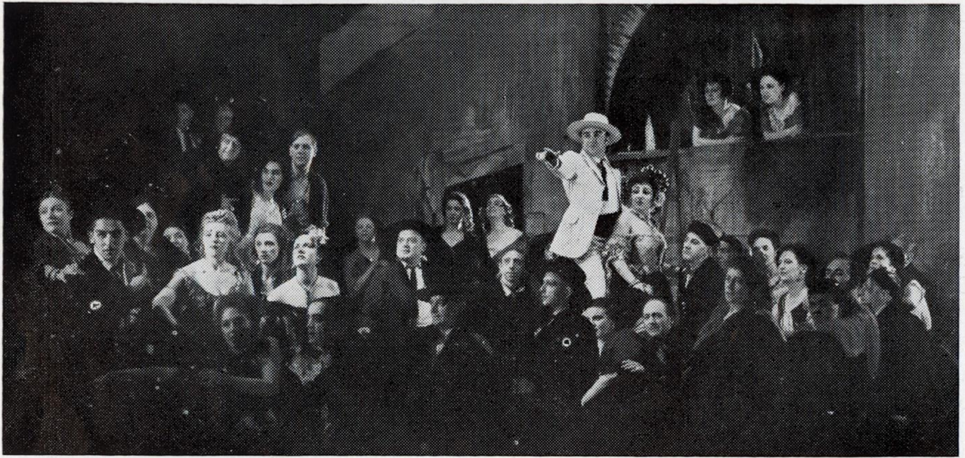
CARMEN—Act II : At Lillas Pastia's Tavern. The Toreador's Song