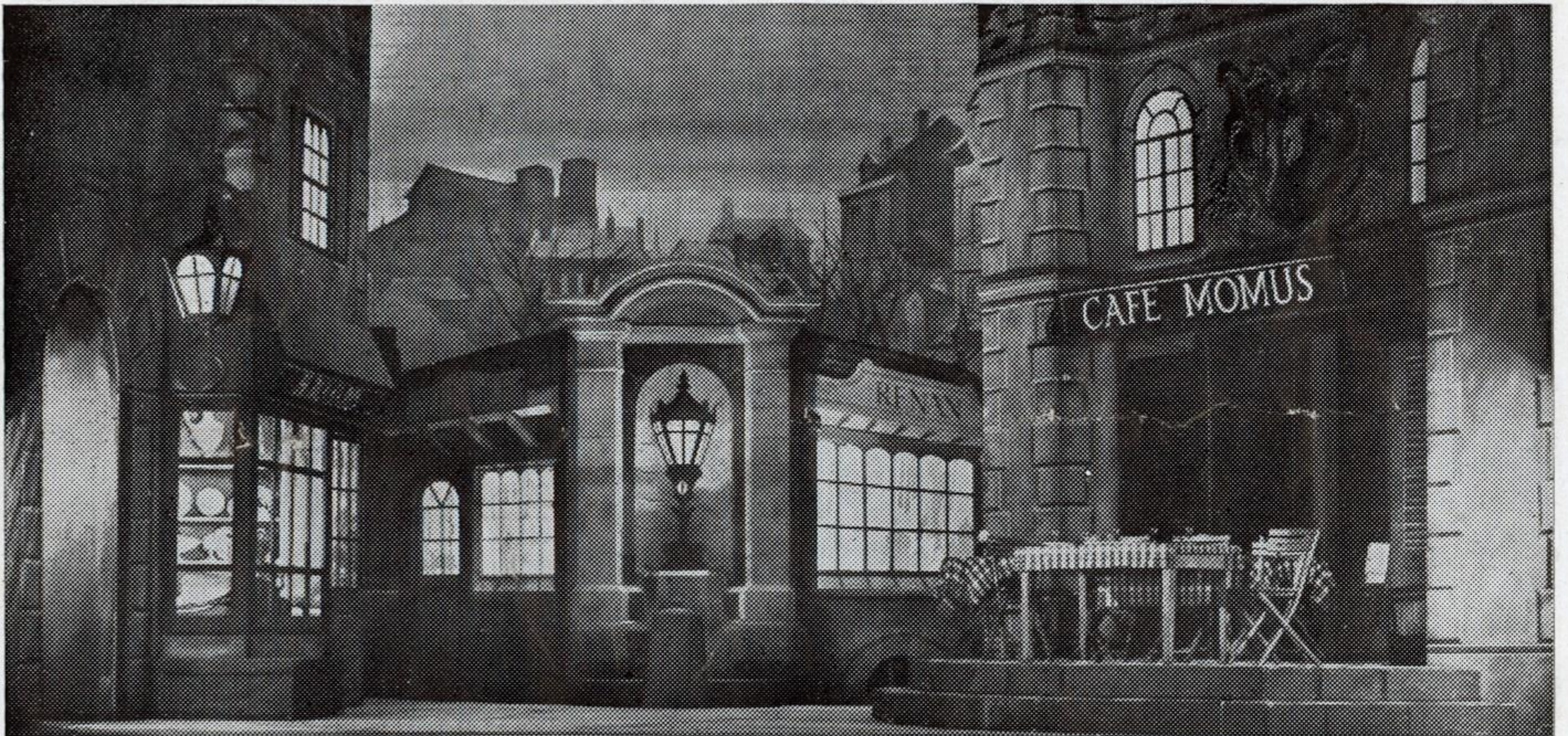
LA BOHÈME—Act II : The Café Momus in the Latin Quarter