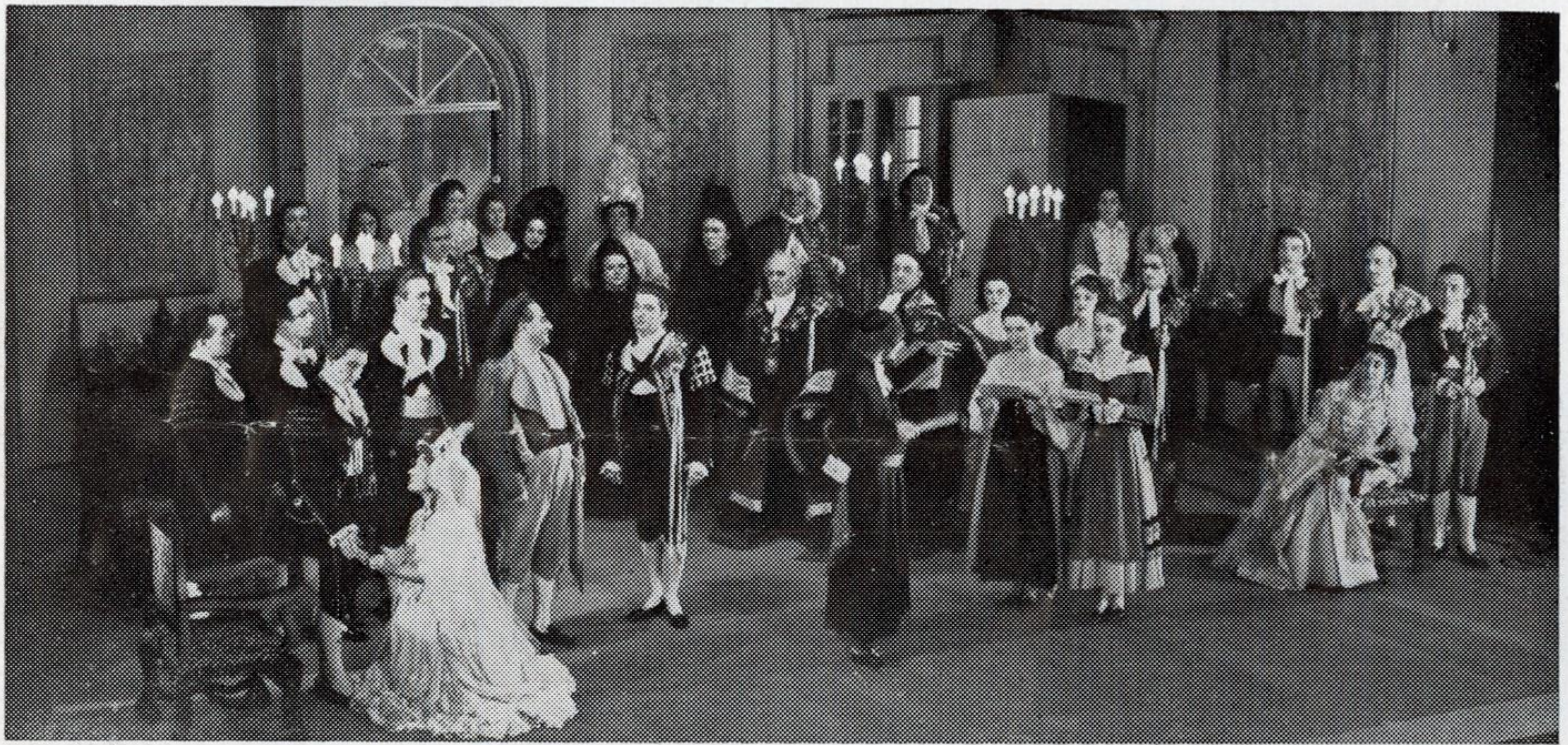
THE MARRIAGE OF FIGARO—Finale, Act III