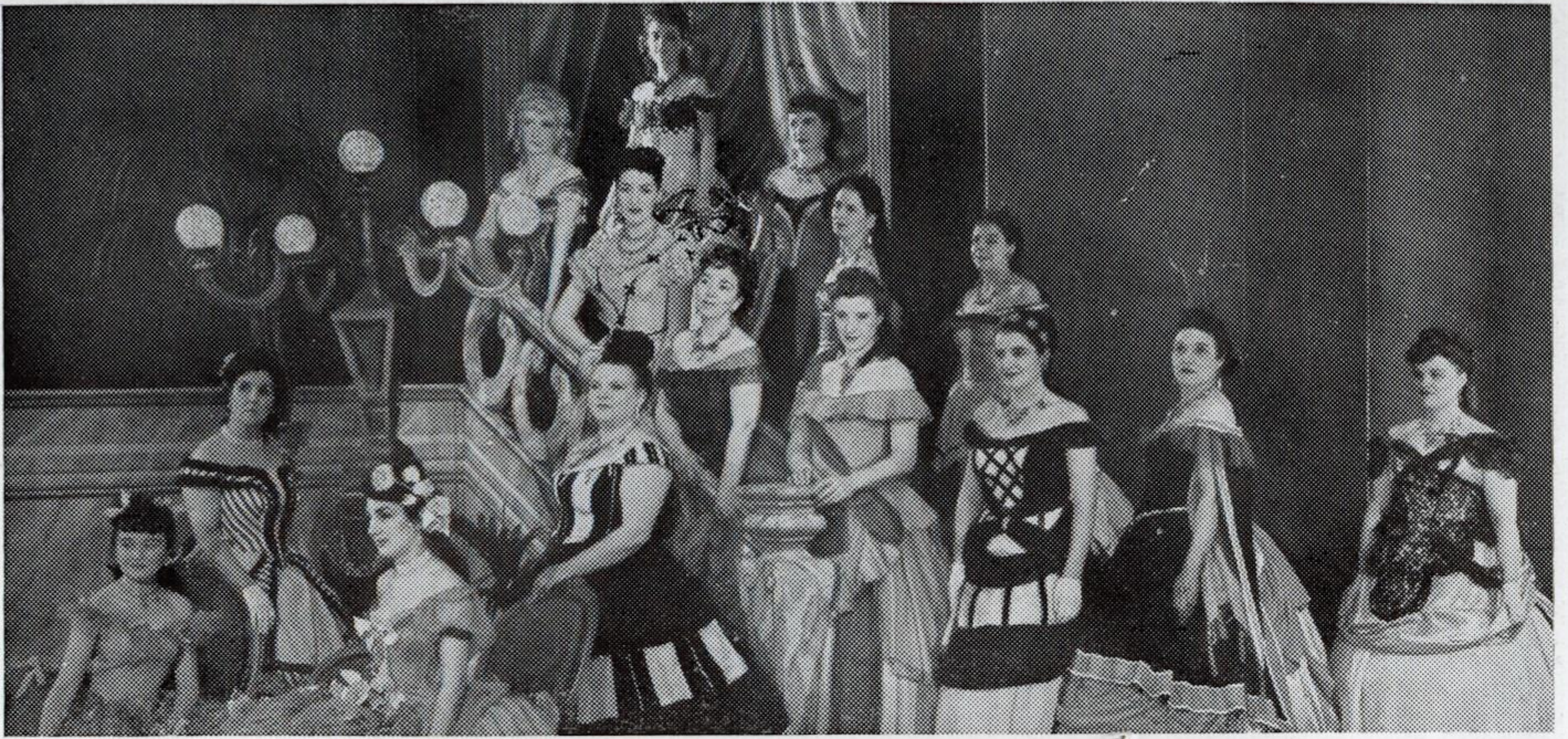
LA TRAVIATA—Act I : The Ball at Violetta's Paris house