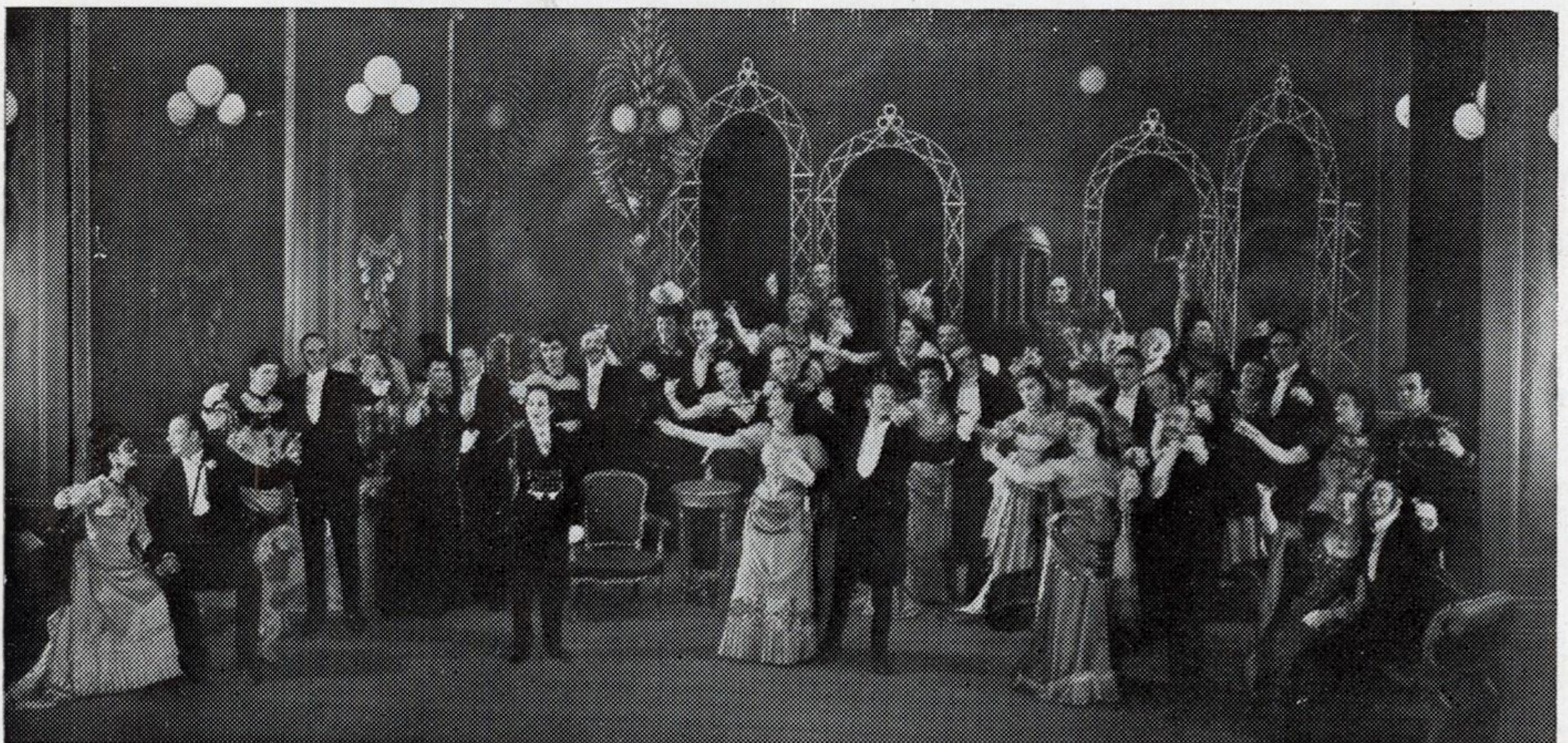
DIE FLEDERMAUS—Act II : The Ball at Prince Orlovsky's house