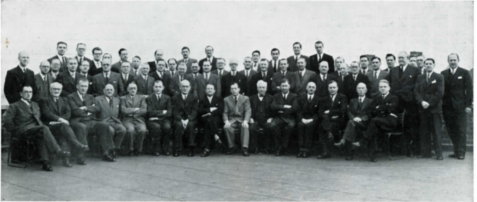
SALES CONFERENCE 1954