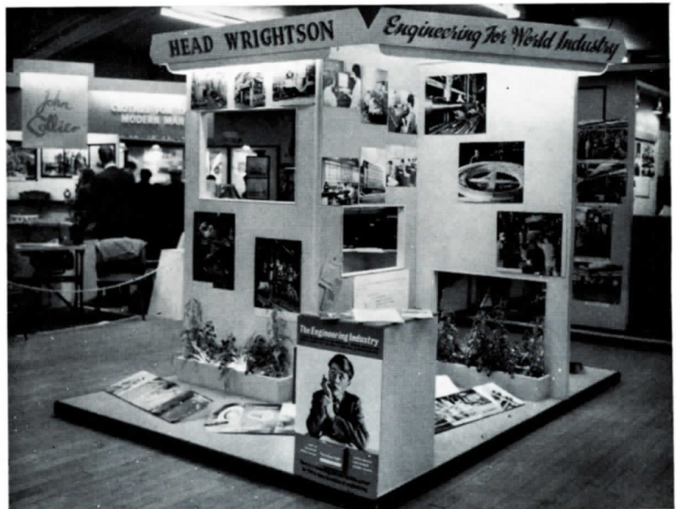
H.W. Stand at Middlesbrough Town Hall

We at Head Wrightson took a full part in all of the activities and in addition to giving careers advice and information at the Stockton and Middlesbrough Exhibitions, we held an Open Day at the Apprentice School and the Head Wrightson Machine Company. Our thanks are due to all those who willingly gave their time in ensuring the success of the Week.