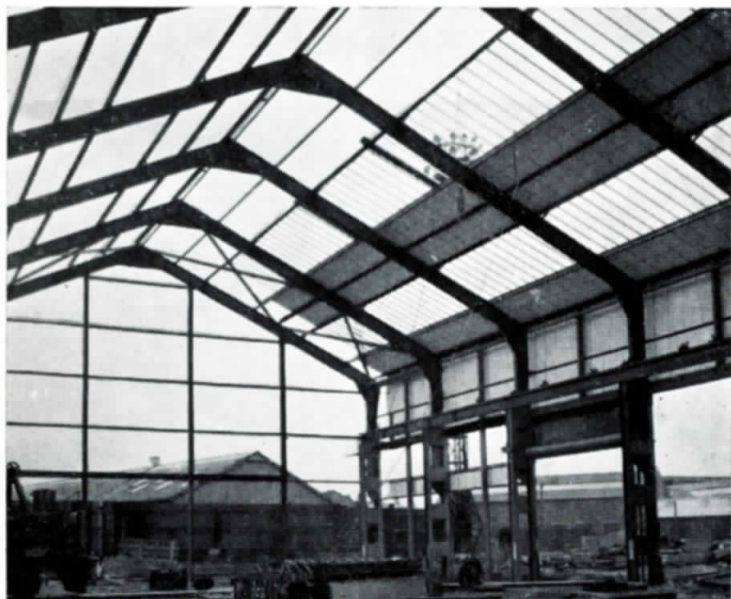
Extension to Welding Shop