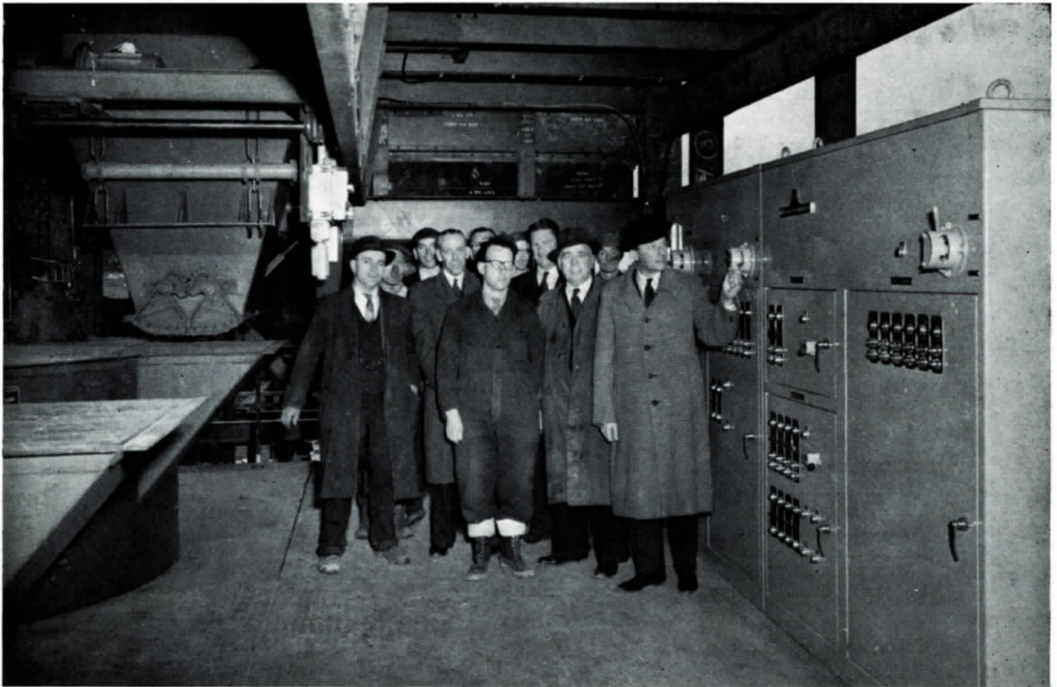
The Chairman, pictured at the Control Panel of the new £100,000 Sand Plant at Egglecliffe Foundry, after having performed the opening ceremony on 2nd May, 1961