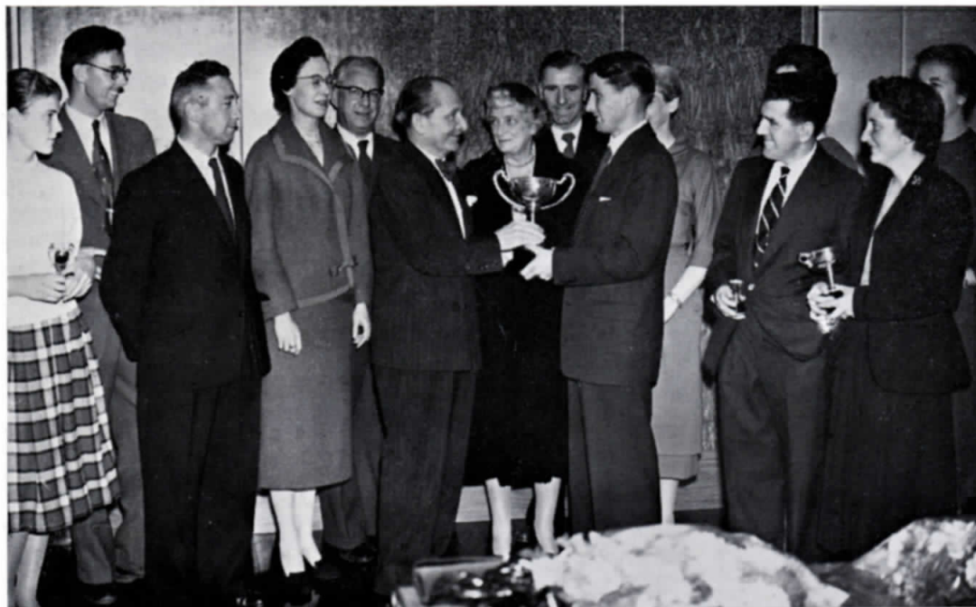
Presentation of Tennis Tournament Prizes