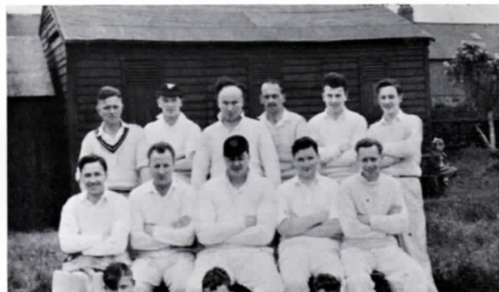
Cricket — 1st Eleven