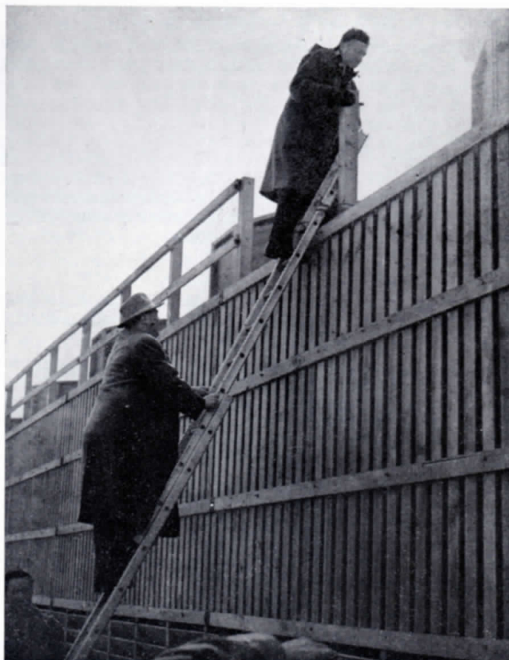
Russian Minister inspecting Cooling Tower at Harwell

Once again our Air Rifle teams showed their prowess, the "B" team being once more successful in winning the Interdepartmental trophy by beating the Heat Exchanger Shop in the final. This victory recompensed the "A" team's defeat by the Heat Exchanger Shop by one point in the semi-final. We are all out now for the 'hat trick.'