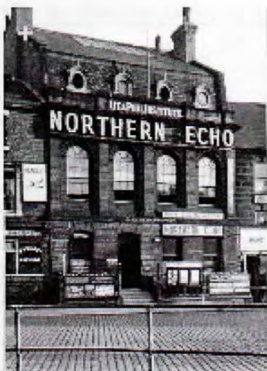
Lit & Phil Building [circa 1950]