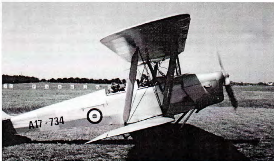
Harry Rhodes (front seat of Tiger Moth) Torquay Airfield, South Australia 1997