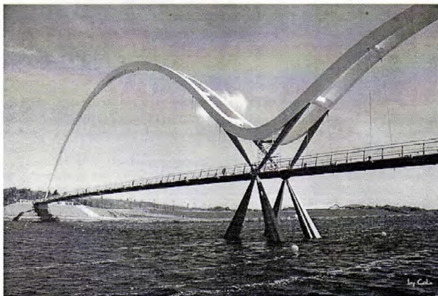
Infinity Bridge - Stockton-on- Tees