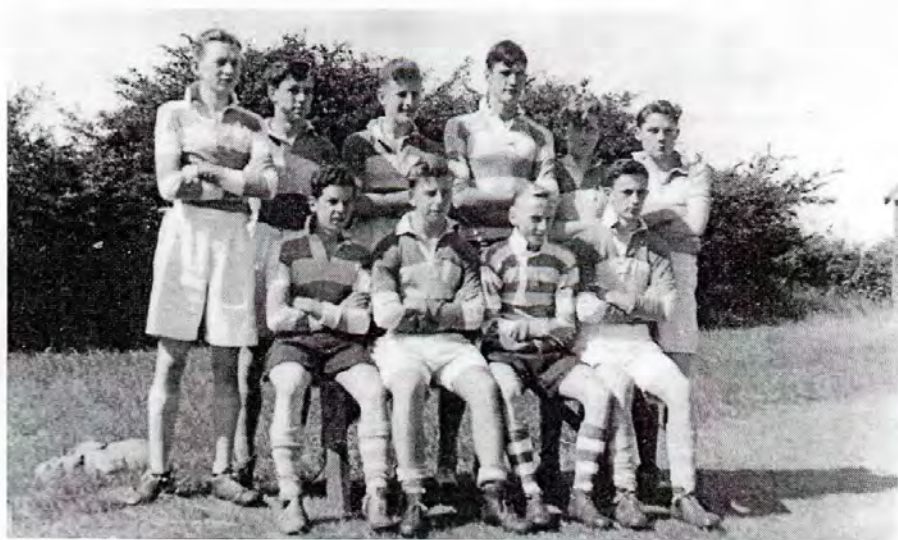
The School 'Rugby' team – 1946