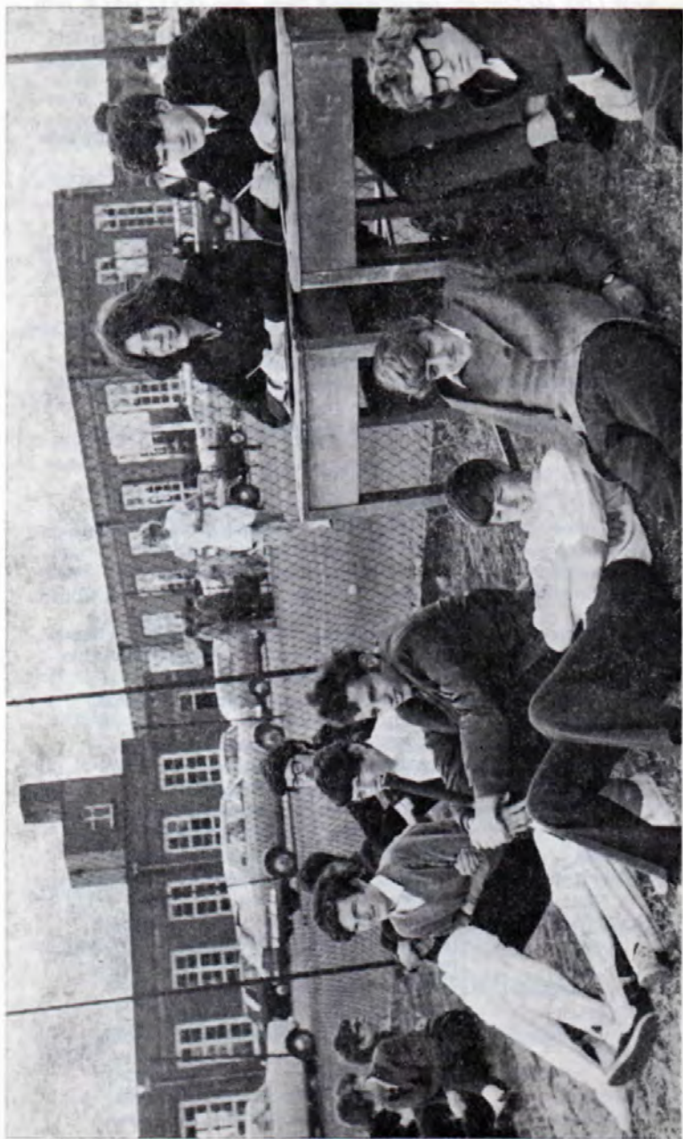
Watching the cricket