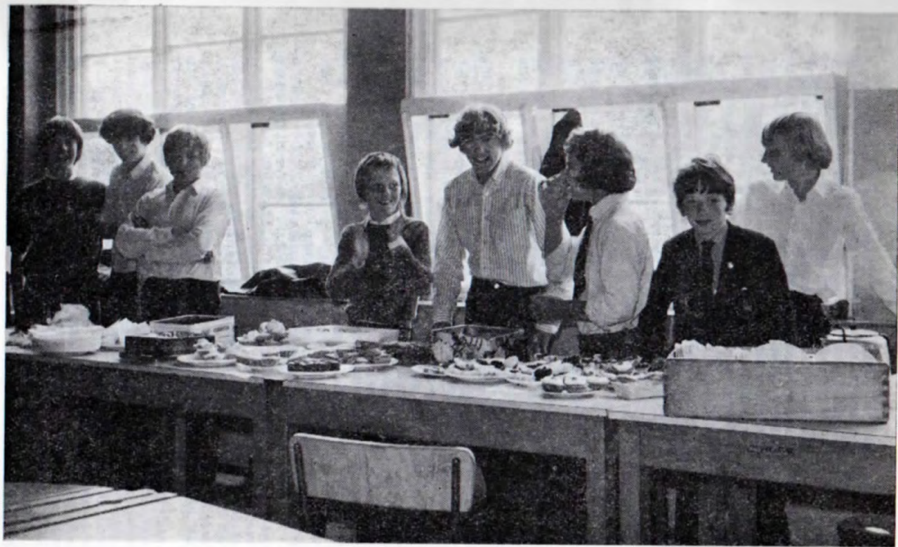
Serving tea (for C.E.M. and N.H.S.)