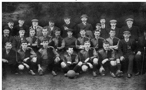
Stockton Football Team 1906-1907